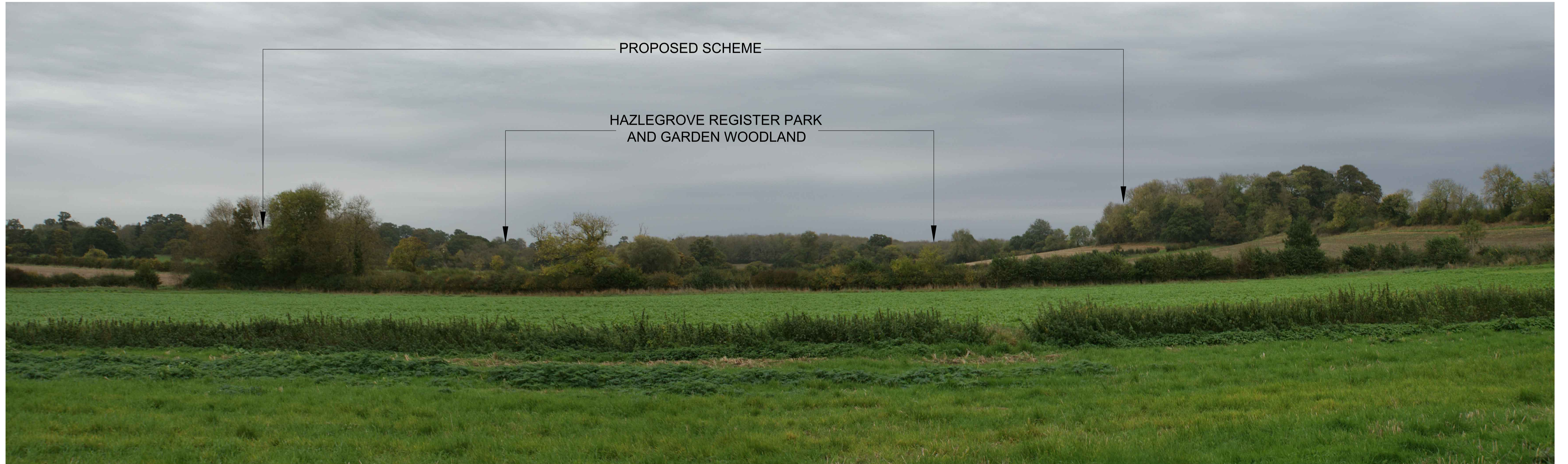
KEY VIEW 26 - EXISTING VIEW LOOKING SOUTHEAST TOWARDS A303 FROM PROW WN 23/33 (FOOTPATH), APPROXIMATELY 760m FROM SCHEME.