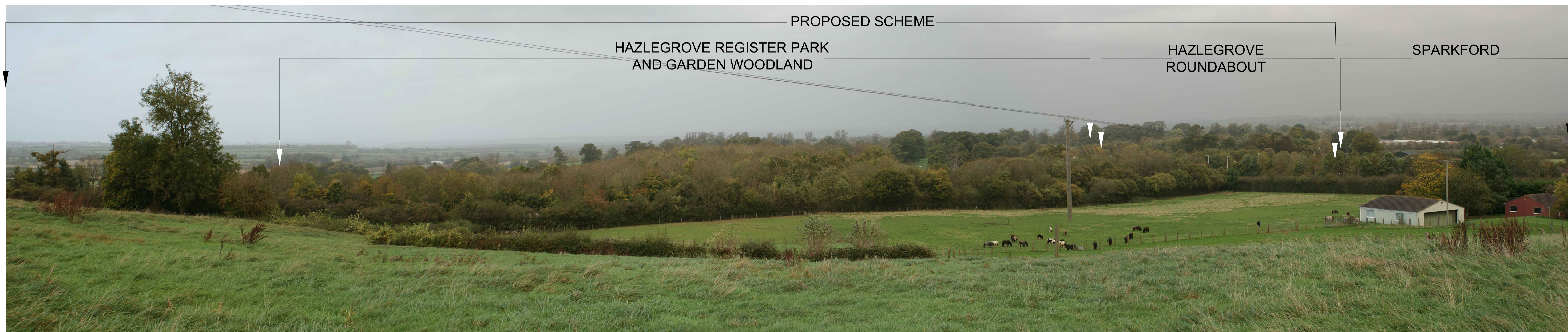
KEY VIEW 36 - EXISTING VIEW LOOKING NORTH TOWARDS PROPOSED HAZLEGROVE JUNCTION FROM PROW WN 27/4 (FOOTPATH), APPROXIMATELY 198m FROM SCHEME.