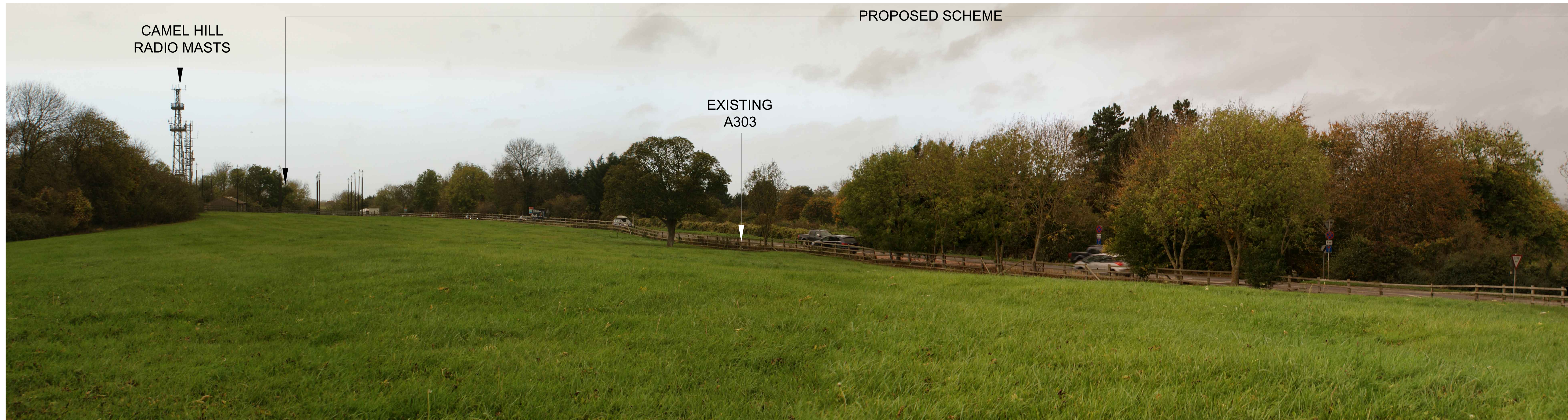
KEY VIEW 30- EXISTING VIEW LOOKING NORTHWEST TOWARDS A303 AND CAMEL HILL FROM PROW NW 23/10 (FOOTPATH), APPROXIMATELY 55m FROM SCHEME.