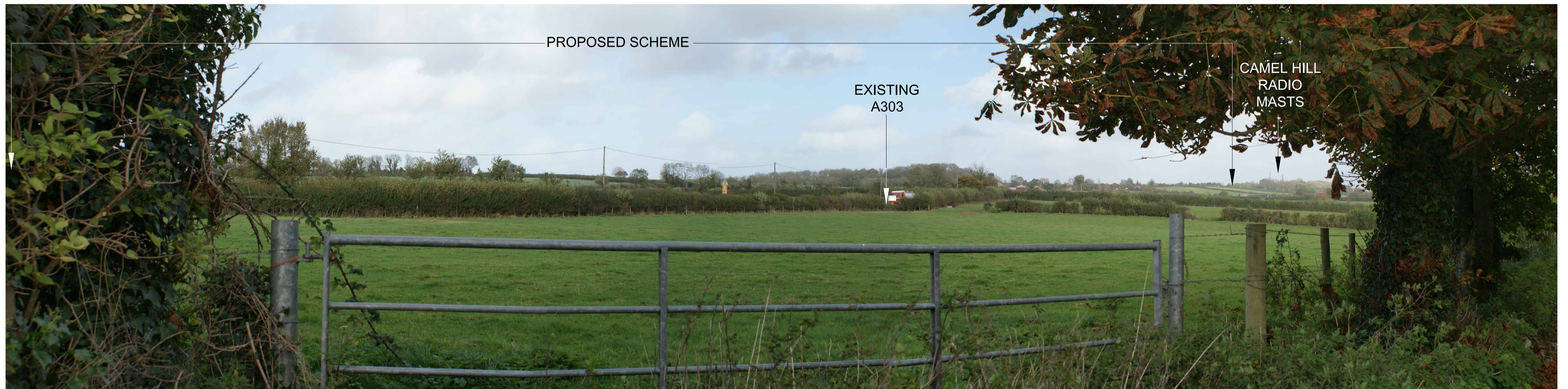
KEY VIEW 12 - EXISTING VIEW FROM PROW Y 27/27 (RESTRICTED BYWAY) LOOKING NORTHEAST TOWARDS THE PROPOSED DOWNHEAD JUNCTION, REPRESENTATIVE OF VIEW FROM PLOWAGE LANE RESIDENTIAL PROPERTY, APPROXIMATELY 168m FROM SCHEME.