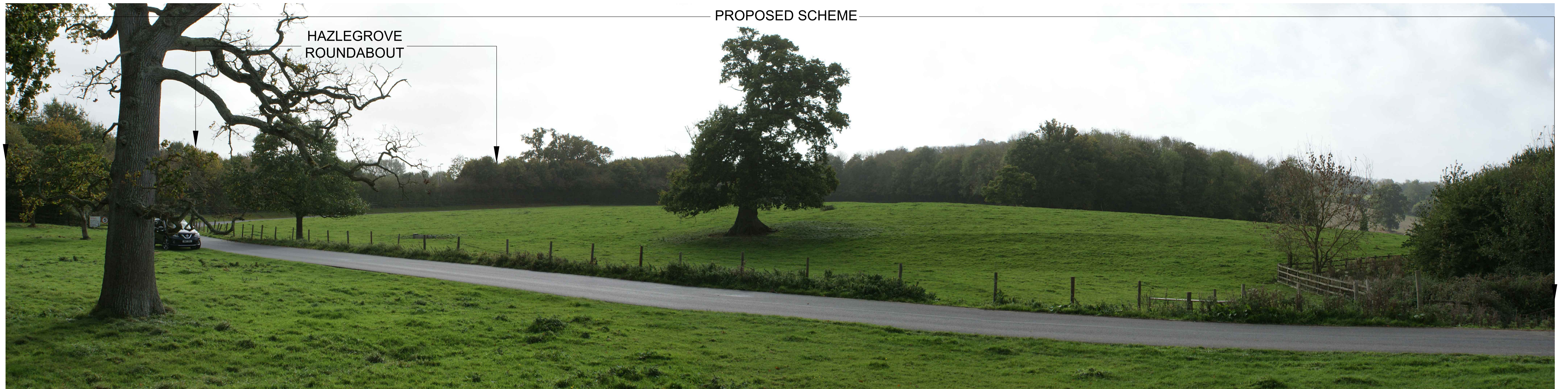
KEY VIEW 38 - EXISTING VIEW LOOKING SOUTHWEST TOWARDS PROPOSED HAZELGROVE JUNCTION FROM PROW WN 23/38 (FOOTPATH) AND HAZELGROVE REGISTER PARK AND GARDEN, APPROXIMATELY 26m FROM SCHEME.