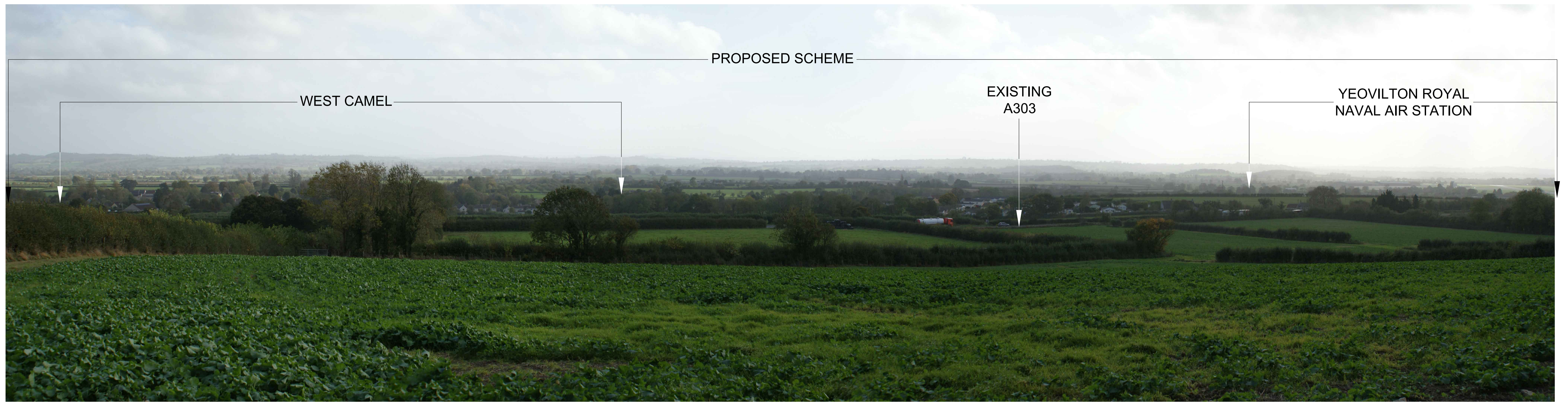
KEY VIEW 14 - EXISTING VIEW FROM SLATE PROW Y 27/20 (RESTRICTED BYWAY) LOOKING SOUTH TOWARDS PROPOSED DOWNHEAD JUNCTION, APPROXIMATELY 105m FROM SCHEME.